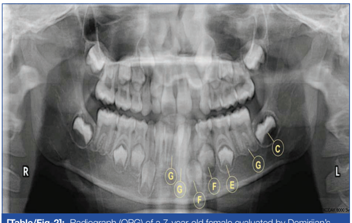
[Table/Fig-2]: Radiograph (OPG) of a 7-year-old female evaluated by Demirjian's method; G- Wall of root canal are parallel but apical end is partially open.in molar distal root is rated; F- Wall of pulp chamber form an isosceles triangle and root length is equal to or greater than crown height; E- Root length shorter than crown length. Wall of pulp chamber are straight and pulp horns becomes more differenciate; C- Enamel formation has been completed at occlusal surface and dentine formation has commenced. No pulp horns are visible.

Method 1: Demirjian's method [7]: In this method, tooth formation was divided into eight stages and criteria of these stages for each tooth were given separately. Each stage of the left mandibular seven teeth is allocated a score from a preformed table of scores as observed on OPG [Table/Fig-2]. The sum of the scores gives an evaluation of the subject's dental maturity and the DA was then calculated using the sex specific tables.